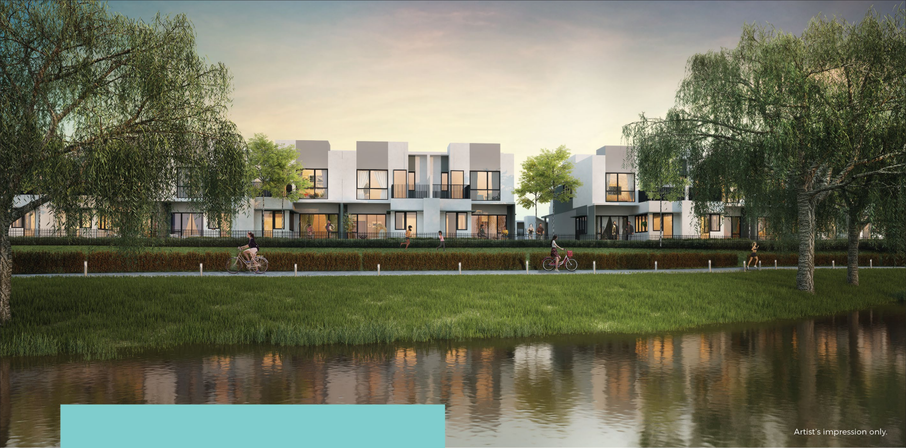
Artist's impression only.